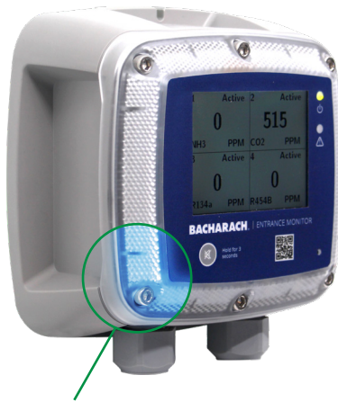
Perimeter Strobe Alarm Status Indication

For Commercial & Industrial Applications